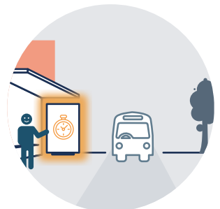
4. Coating remains active even several hours after UV/daylight exposure