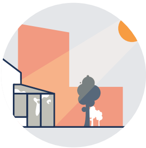
1. Coating is activated by UV light