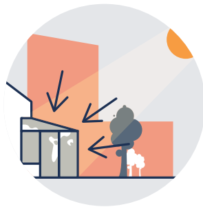
2. Organic deposits are destroyed