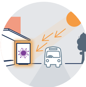
2. Invisible active radicals are created on the glass surface by photoactivation