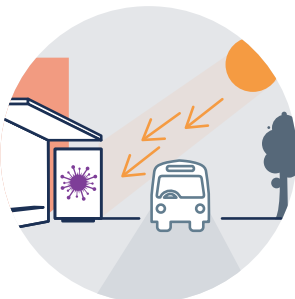
1. Coating is activated by daylight or UV light