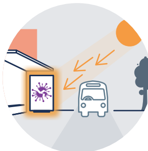
3. Virus on surface are broken down by active radicals